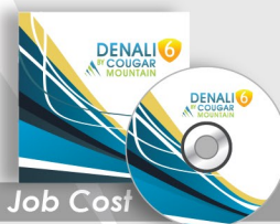
Latest: Denali 6 with Job Cost